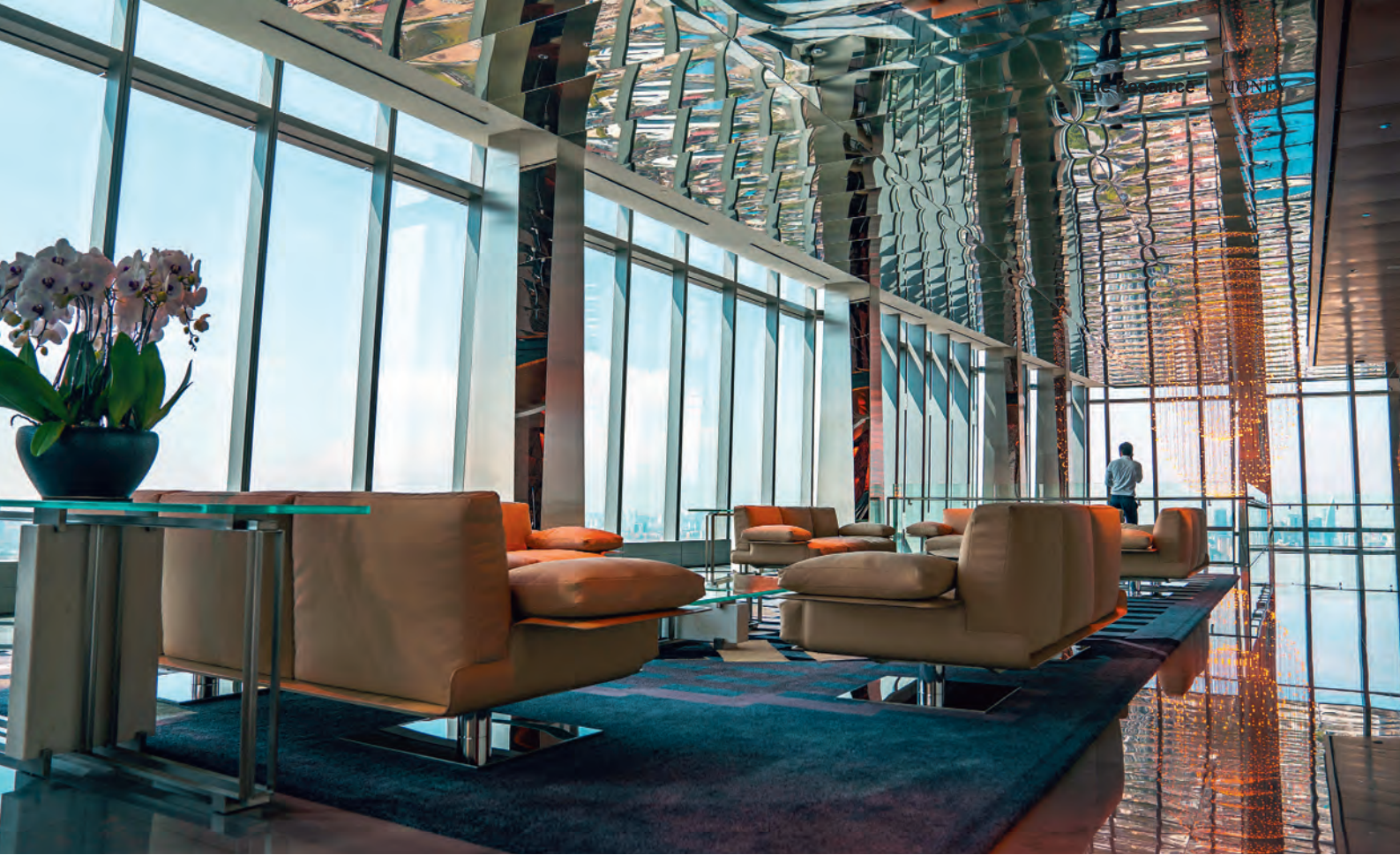
The Sky Lobby on level 57 is a transition zone with its own concierge, restaurants and lounge.

usage of lights for perimeter illumination as well. Equally impressive is that the building – which offers 2.67 million sq ft of net lettable area – has been constructed from over 30 per cent recyclable materials and sustainable timber, a hallmark of its commitment to sustainability.